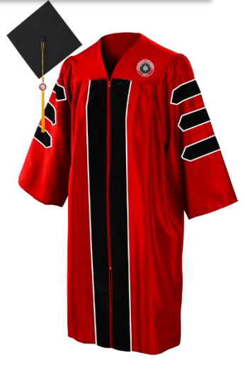
PhD Unit Cap, Gown, Hood, Tassel $145