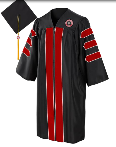
Doctor Unit Cap, Gown, Hood, Tassel $145